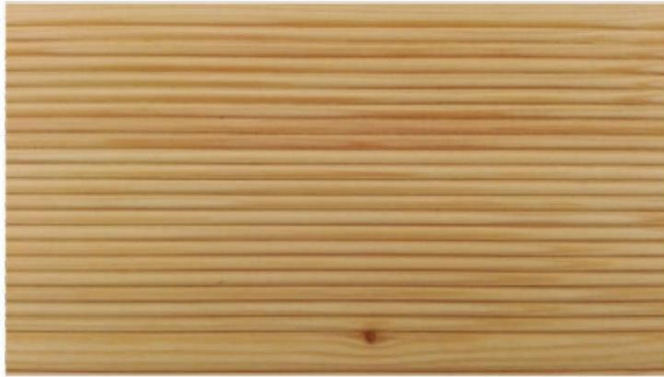
The example of a knot in extra class