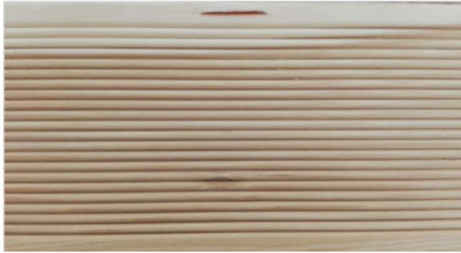
The example of a resin pocket in extra class