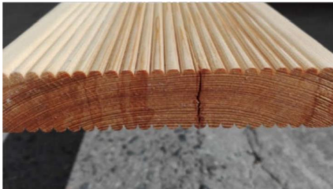
The example of a frontal crack in extra class